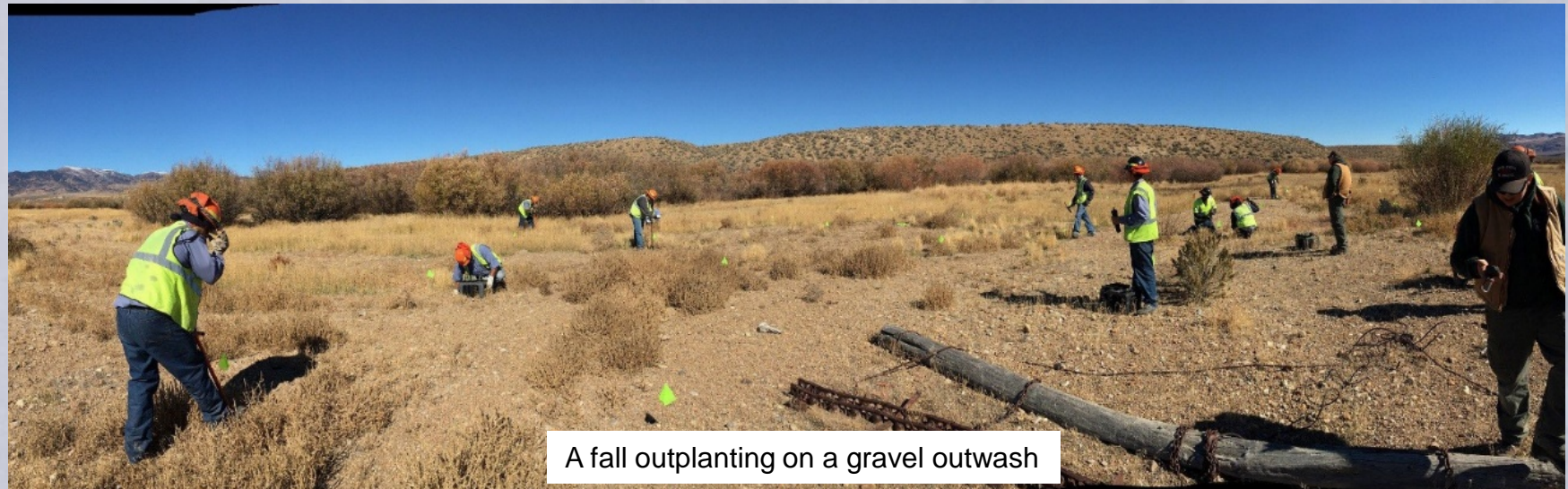
A fall outplanting on a gravel outwash